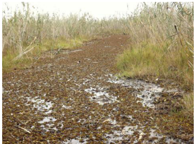
A clogged canal in the Lukanga Swamps which is major route