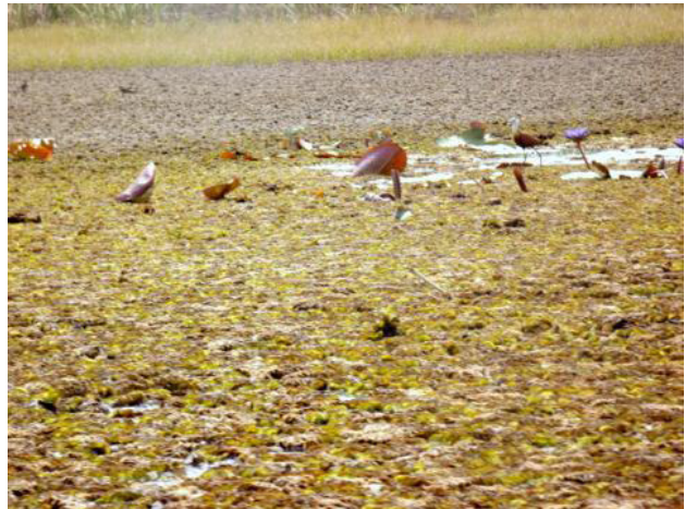
Isasa lagoon within the Lukanga Swamps, infested by the Kariba Weed

BirdWatch assisted with local bird guide training and certification by Leslie Reynolds. Added to this the area Machile was linked with South West Barotse Tourism Trail promoted and marketed by Open Africa Initiative.