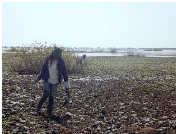
Kariba Weed , Mimosa pigra and Water Hyacinth growing in harmony in Lochinvar

The Lukanga swamps on the other hand, have not been so lucky, particularly in terms of exploration and publicity. For a start, some reports have been reporting the alien plant in Lukanga as the Water Hyacinth ( Eichhornia crassipes ), when the plant is actually the Kariba Weed ( Salvinia molesta ).